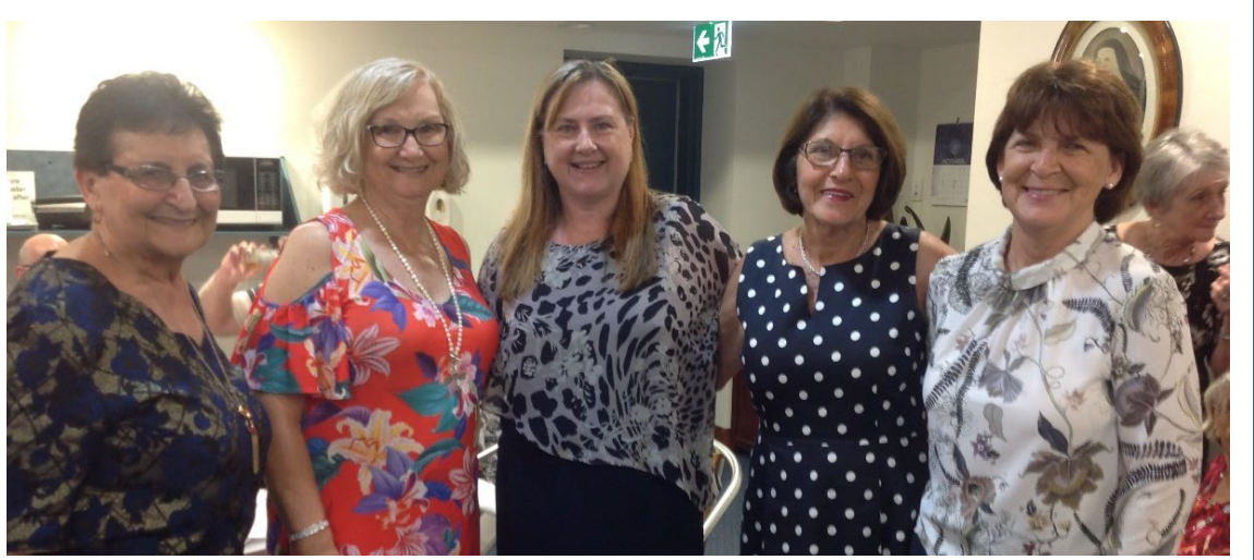
Mater Auxiliary Committee Members